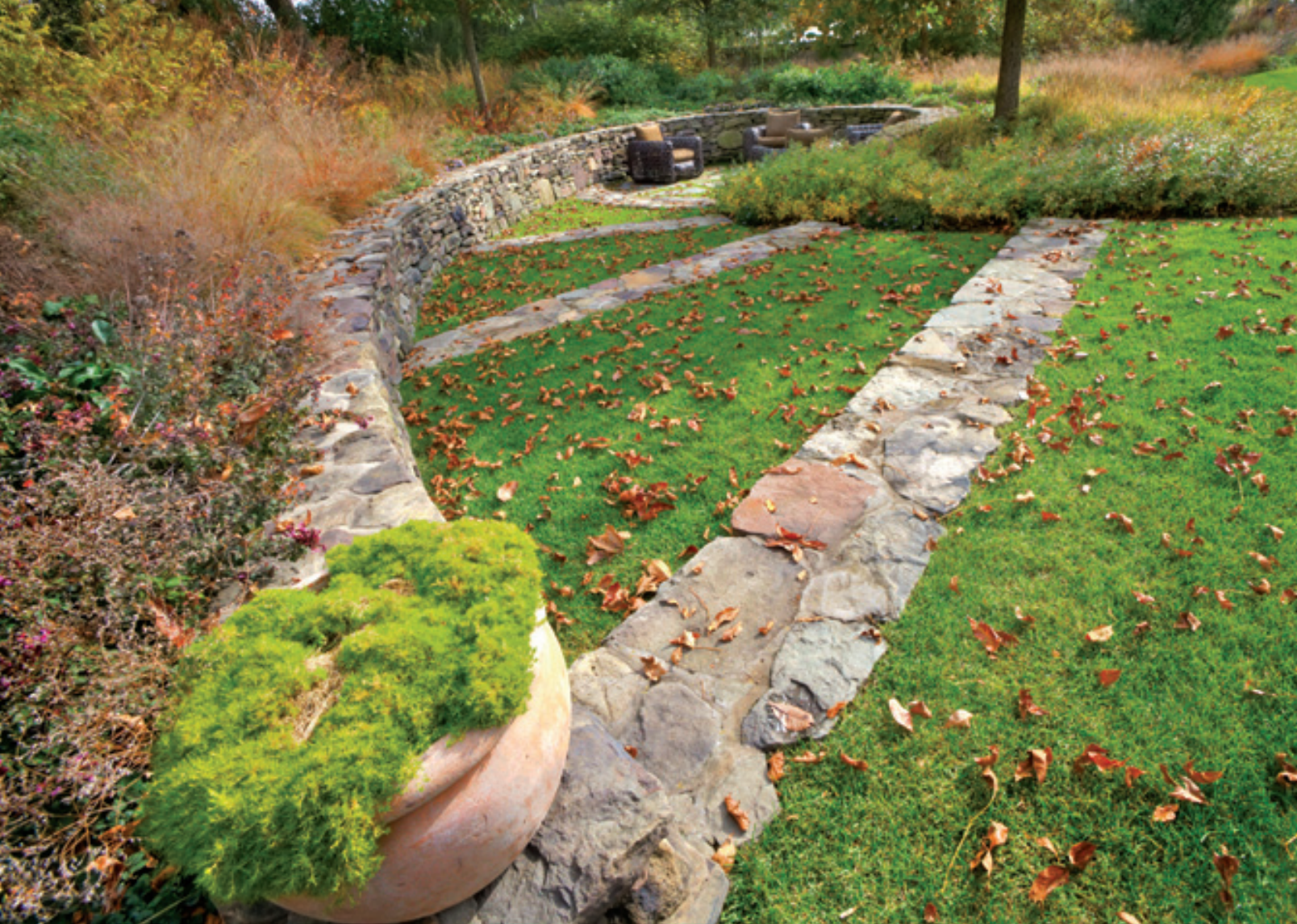
Above: Is it a sunken garden or a Jens Jensen council ring? However you interpret it, the circular seating area, located off to one side of the large open lawn, is a comfortable place to read and converse. Right: A bluestone walkway angles over a water feature that leads into a fountain at its end point.

Colors ranging from reds, oranges, yellows and browns emerge from the diverse plant palette and reflect against the rich green colors of the evergreens.”